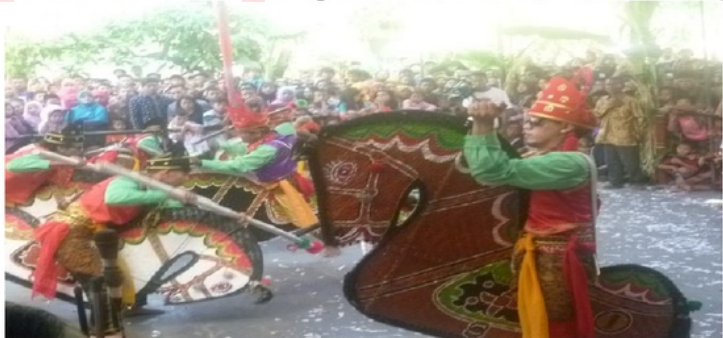
Figure. 1. The Performance of Reog in Klaten, Central Java, Indonesia (2015).