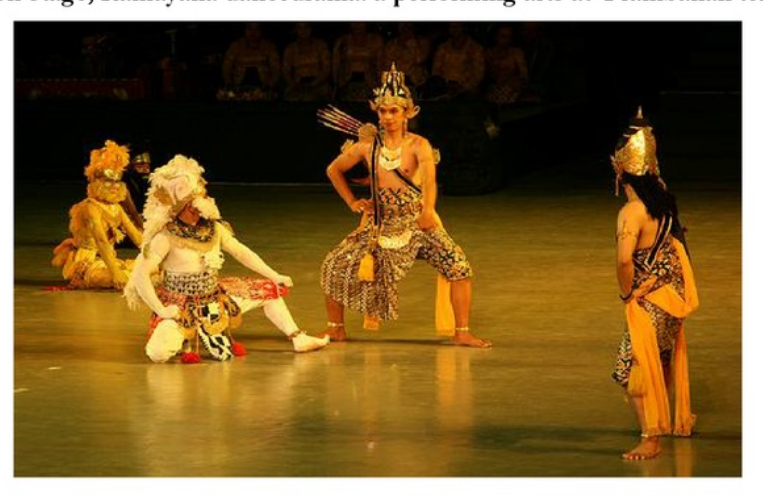
Figure. 2.Rama on Stage, Ramayana dancedrama: a performing arts at Prambanan temple, Indonesia